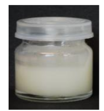
Macroscopic view of gel