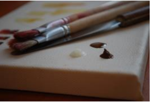
On canvas, the consistency of gels and gel-paint mixtures differs greatly from that of paint alone, which spreads without retaining volume.

The findings of thesis research begun in November are expected to elucidate the chemistry of these hybrid gels. The challenge is to determine how the lead binds with the resin, the conditions for conservation of these mixtures, and those under which they break down.